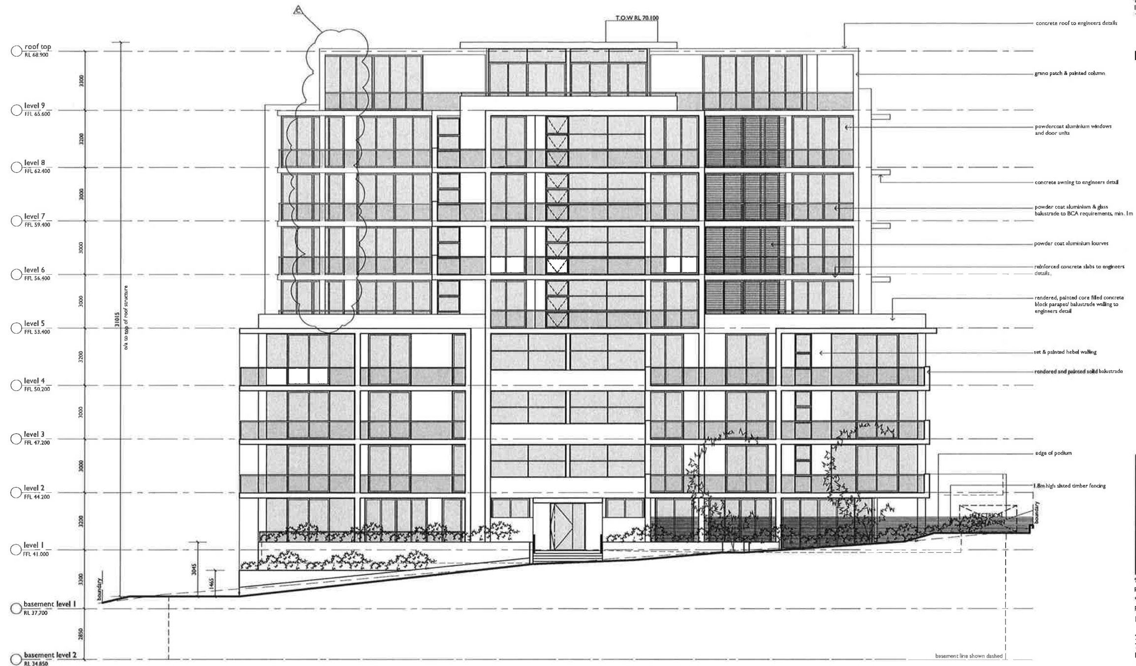
EAST ELEVATION VIEW FROM CHURCH STREET